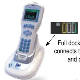
Full docking station, connects to printer, PC and charger