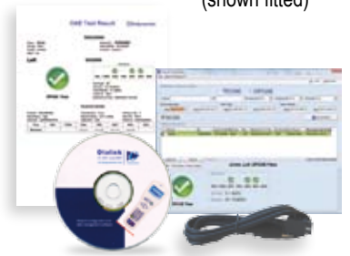
Otolink PC software and download cable