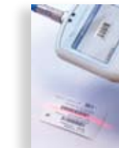
Integral barcode ID reader (optional)